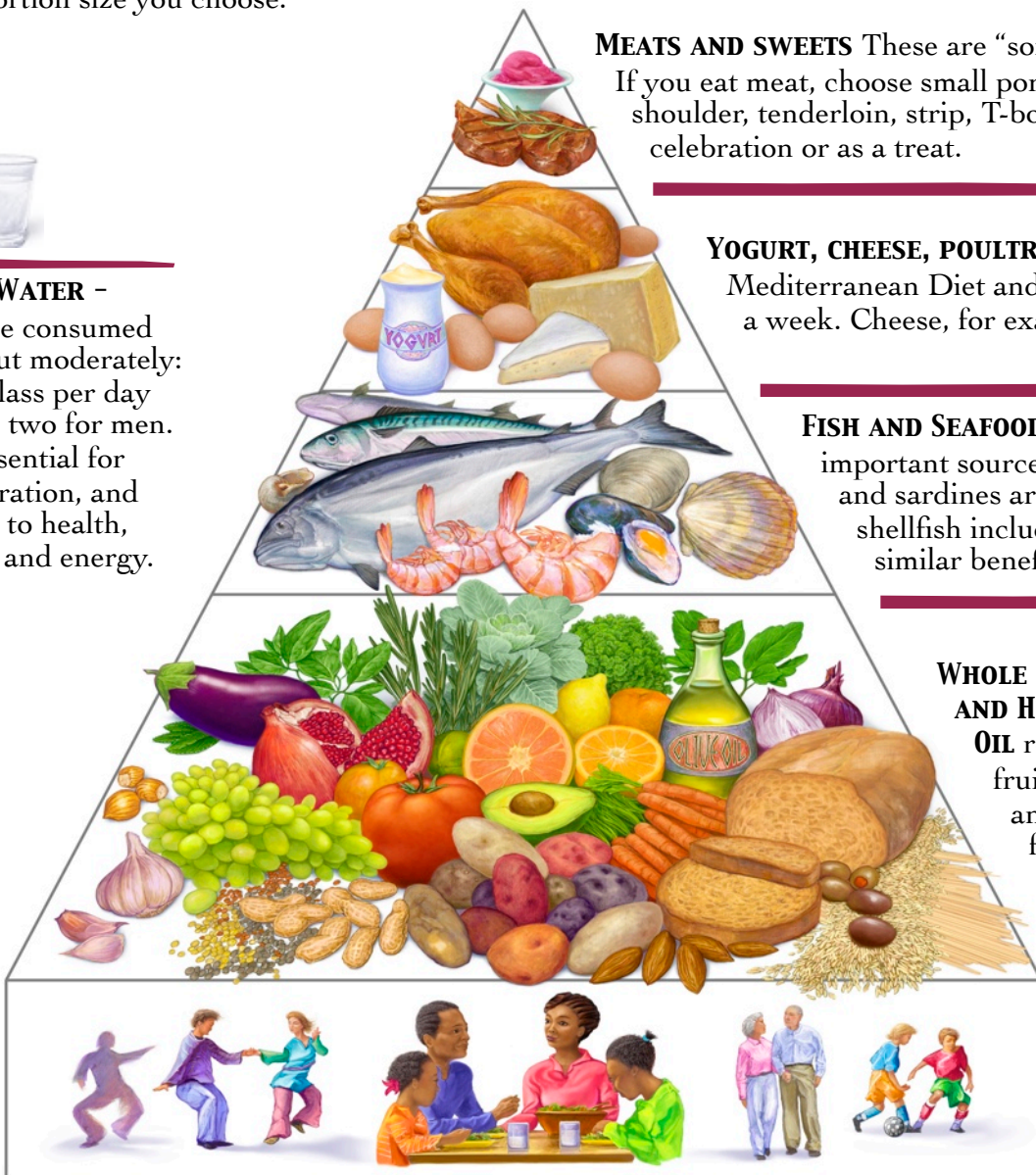
Illustration by George Middleton

Wine can be consumed regularly but moderately: up to one glass per day for women, two for men. Water is essential for proper hydration, and contributes to health, well-being, and energy.